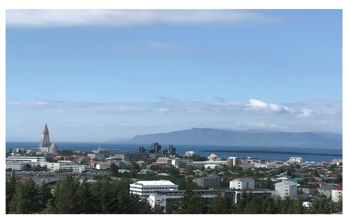
Reykjavik, Island.